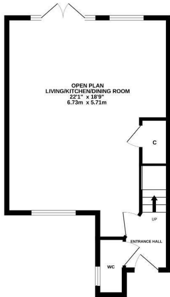
GROUND FLOOR 486 sq.ft. (45.2 sq.m.) approx.